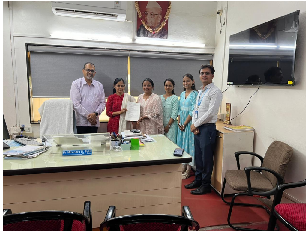
MOU with Sardar Patel College of Engineering, Andheri