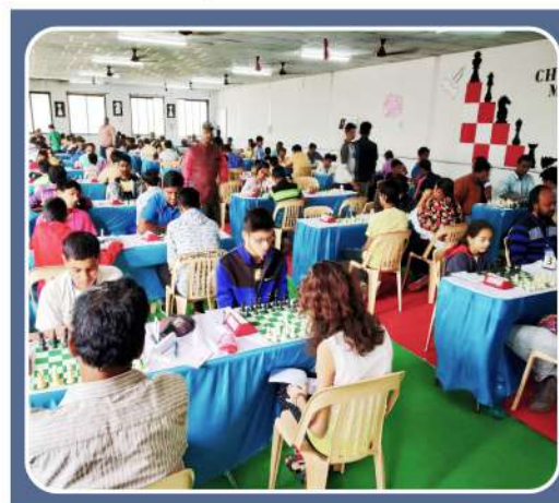
[ Recently our college had organised A National Level Fide Rating All India Chess Tournaments in which 187 participants from all over India took part ]