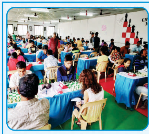
[ Recently our college had organised A National Level Fide Rating All India Chess Tournaments in which 187 participants from all over India took part ]

2 Table Tennis & multiple Chess and Carrom boards